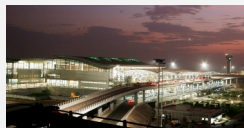
Rajiv Gandhi International Airport, Hyderabad, India