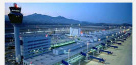
Heraklion International Airport Crete, Greece