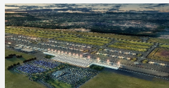
Goa International Airport Mopa, Goa