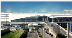
Indira Gandhi International Airport, New Delhi, India

Delhi | Hyderabad | Goa | Philippines | Greece