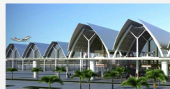
Mactan Cebu International Airport, Cebu, Philippines